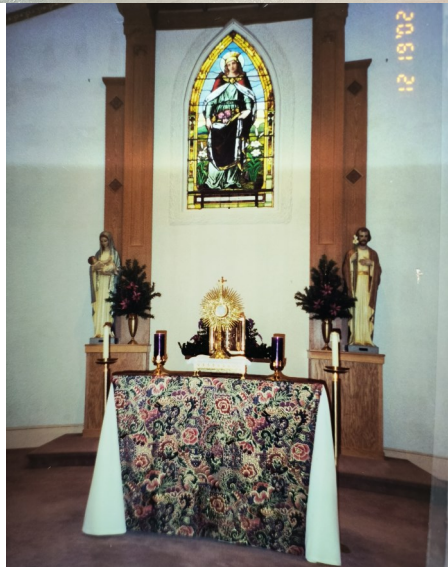
Left: St. Elizabeth Altar pre-2003 renovation