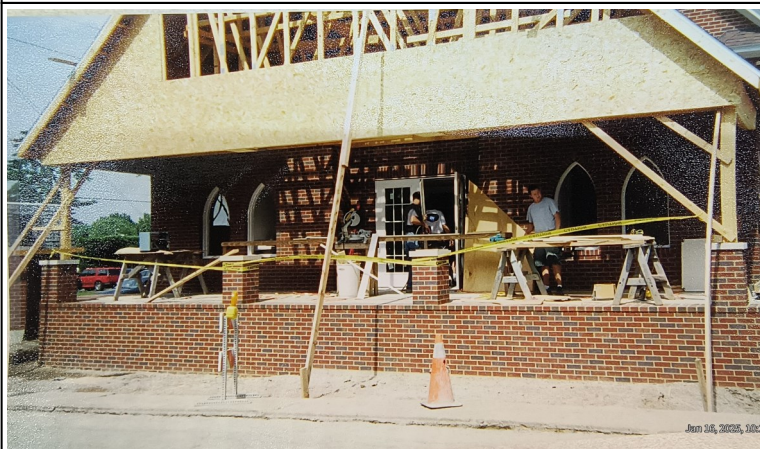
Above: St. Elizabeth Portico and church extension being built, 2003