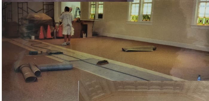
Above: Bare church nave floor during 2003 construction