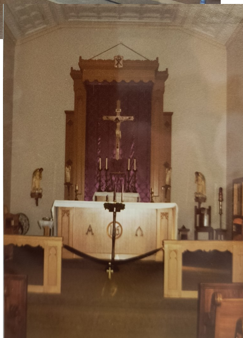
Right: Our Lady of Lourdes Altar Date pre - 1988?