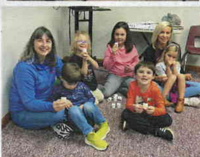
December 4, 2024

Where would we be without our teachers and volunteers??